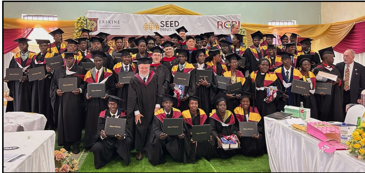
47 graduates received their Global Diploma by Erskine.